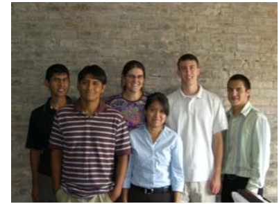
2007 Navigate Summer Fellows

NAVIGATE young adults are committed to develop themselves as leaders. NAVIGATE young adults learn to speak on behalf of immigrant communities to leaders in higher education. One NAVIGATE leader said, “I was nervous to meet a College Dean and to speak to someone who was not an immigrant about the barriers that students like me are facing. After speaking, it was good to know that there are people who are willing to help us.”